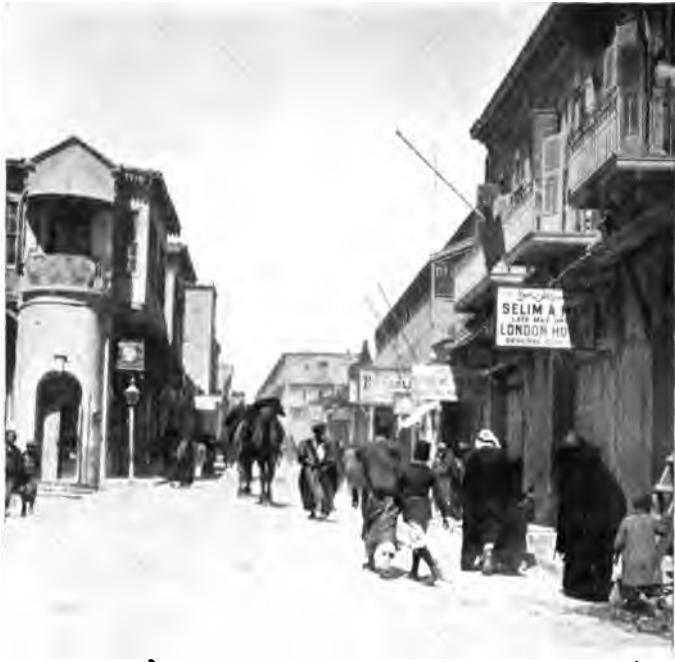
A STREET IN JERUSALEM